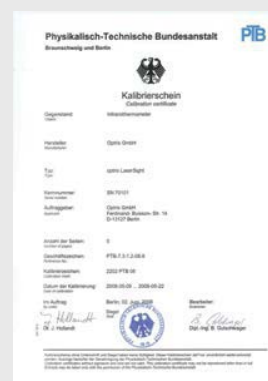
certificates of PTB institute