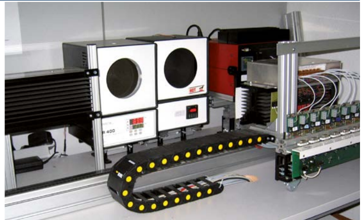
Automated calibration stations at Optris GmbH

Based on the CTlaser-PTB, Optris produces the CTlaser-DCI as a high-precision reference IR thermometer for its customers . The DCI units are produced with pre-selected components supporting a high stability of measurement. In combination with a dedicated calibration at several calibration points the CTlaser-DCI achieves a higher accuracy than units from series production.